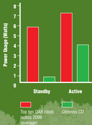
Chronos CD power consumption vs. industry average